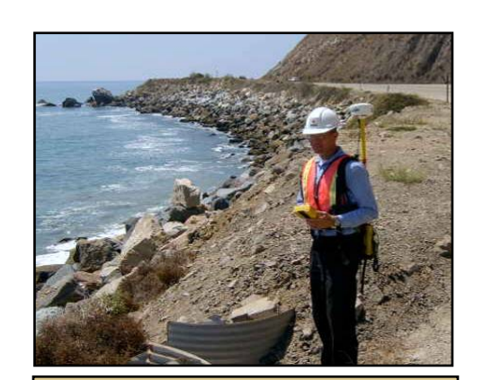
GPS Outfall Identification